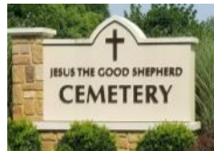
JGS Cemetery Catholic Cemeteries: 301-475-5005