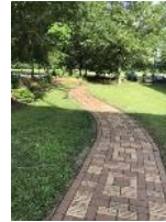
JGS Brick Walkway in the Prayer Garden